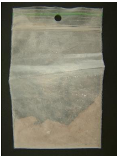
Figure 1: Zip-locked plastic bag containing a brown powder that was recovered from the scene. Analysis of a sample of the powder identified ocfentanil as the main psychoactive ingredient; caffeine and paracetamol were also present.

The decedent was found dead at home. Ocfentanil was identified in post-mortem blood samples, but has not yet been quantified (GC-MS analysis was performed). Examination of the nasal tract suggests that the ocfentanil was snorted; no needle or injection sites were identified on the body. The decedent had no known previous history of heroin usage. A small zip-locked plastic bag containing 2.07 grams of a brown powder was recovered from the scene (Figure 1). Analysis of a sample of the powder identified ocfentanil as the main psychoactive ingredient; caffeine and paracetamol were also detected. The source of the ocfentanil has not been confirmed yet, but one possible scenario is that the decedent purchased the ocfentanil through the Internet, and possibly from a darknet site.